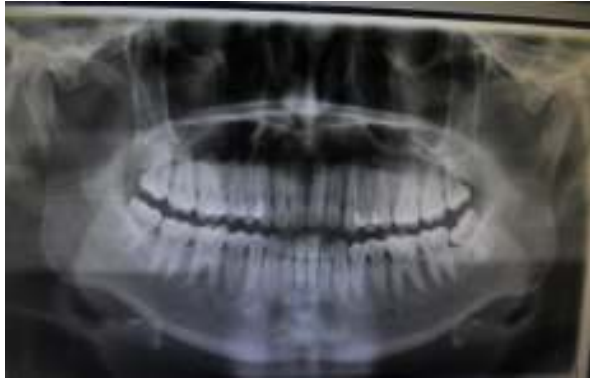
Fig 3: Panoramic radiograph showing radio opaque mass in the left posterior region of maxilla

Radiographs were advised including an intraoral periapical radiograph, panoramic radiograph as well as aparanasal sinus view. Radiographs showedthe presence of a radiopaque mass with respect to the distal surface of 25 extending upto mesial surface of 28 and involving the apices of the roots of 25.26.27 and the mesial surface of 28. Superiorly the lesion extendsupto the floor of the maxillary sinus with elevation of the floor of the sinus.