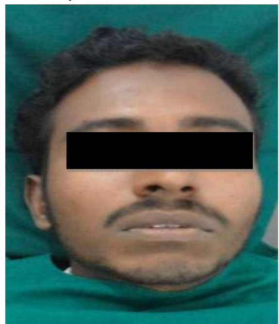
Fig 1:Clinical photograph showing facial asymmetry

A male patient of age 22 years reported to our institute with the chief complaint of difficulty in brushing his teeth, as well as of enlargement of the upper part of face on the left side. There was no history of trauma or any other relevant medical or dental history.