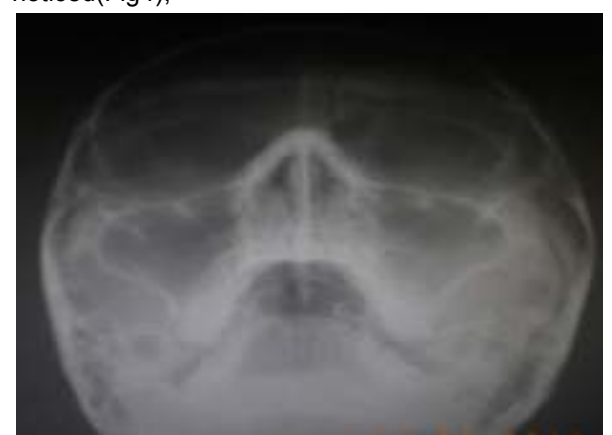
Fig 4:PNS view showing the elevation of maxillary sinus.

Incisional biopsy was performed and on gross examination the specimen showed 2 bits of bony tissue which were creamish in colour and both measuring approximately 1x1x0.5cm and hard in consistency. Both the bits were decalcified and then routine tissue processing was carried out. Histopathologically, initial sections showed fibrous connective tissue stroma composed of numerous multinucleated giant cells of varying sizes, with numerous nuclei ranging from 2-10 in number and areas of bony trabeculae. In few of the bony trabeculae and osteoblastic lining noticed(Fig4),