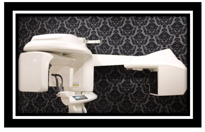
Figure 1: CS-9300S digital panoramic and cephalometric system

positions, or any other conditions which make it difficult to identify the landmarks were rejected from the study. All the participants were within the age group 15–25 years with a mean age of 15.4 \pm 3 years.