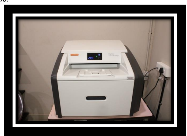
Figure 2:L Carestream Dryview 5700 laser imager

The lateral cephalograms were taken in natural head position with eyes looking straight ahead, teeth in maximum intercuspation and the lips in a relaxed position. The patient's head was immobilized using a cephalostat. Patients were positioned with Frankfort horizontal plane parallel to the ground and perpendicular to midsagital plane before taking radiographs. All cephalograms were captured with CS-9300S digital panoramic and cephalometric system (Figure1) to ensure standardization of cephalograms. The tube potential was 90 Kvp and the current was 15 mA. The radiographs were obtained in the JPG image format. All digital cephalograms were printed using Carestream Dryview 5700 laser imager (Figure 2). All digital radiographs and printouts were of magnification 100 %.