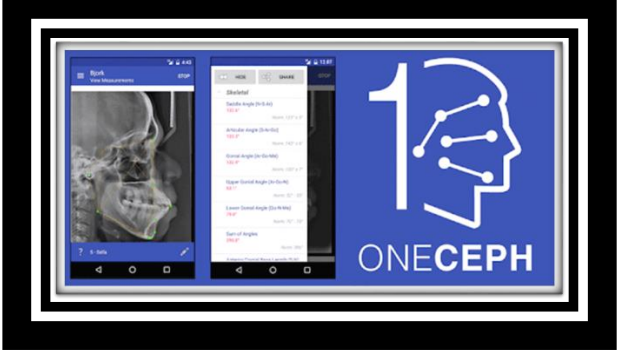
Figure 3: One ceph app

using a stylus. After finishing landmark plotting, linear and angular measurements of Steiner's analysis were derived from the OneCeph application.<sup>15</sup> All cephalometric measurements observed were entered into the Excel spread sheet.(Figure 3)